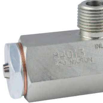
Visual indicator of clogged filter element In retracted position