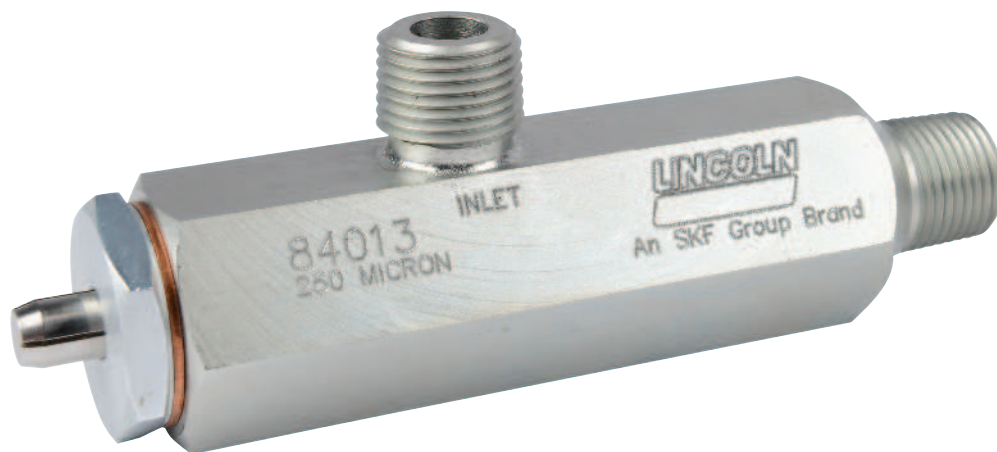
Small grease reservoir filling filter 84013

The Lincoln small grease reservoir filling filter was developed to minimize contaminants entering the automatic lubrication system during the fill process of smaller-sized reservoirs. Part of SKF's family of grease filtration products, the filling filter helps to ensure the system starts the lubrication process with clean grease.