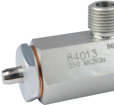
Visual indicator of clean filter element In extended position